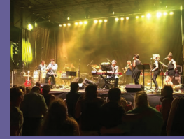
Rock 'N Wheels Concert