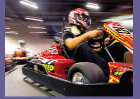
Fun at K1 Amusement Center